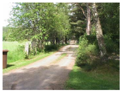
Fig's 3 & 4: access lane serving Craigmore cottage and other properties.