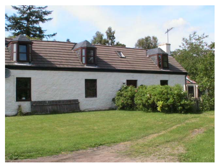
Fig. 2 - Craigmore Cottage